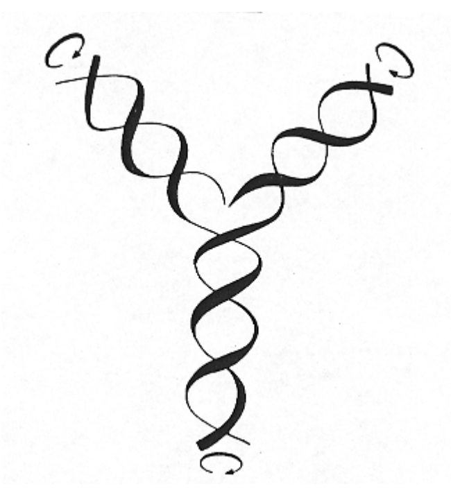
Fig. 2. The scheme of Watson and Crick for DNA replication. "Unwinding and replication proceed pari passu . All three arms of the Y rotate as indicated." (14).

and CRICK (87) as a corollary to their structural model whereby DNA occurs as a two-stranded helix with the bases being centrally oriented. When their relative positions are fixed by the deoxyribose-phosphate backbones, just two pairs of bases are able to form hydrogen bonds between their respective NH and CO groups; these are A: T and G: C. This pairing of bases would tie the two strands together for the length of the helix. In conformity with this model, extensive analytical evidence shows a remarkable equality of A with T and of G with C in DNA from